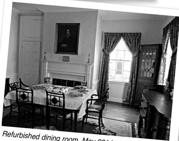
Refurbished dining room, May 2014

The Dining Room project required the input of a number of skilled tradespersons as well as expert advice and skill from staff of the New Brunswick Museum, who advised on the colour scheme, wall paper and draperies used in the project, and helped hang a number of paintings.