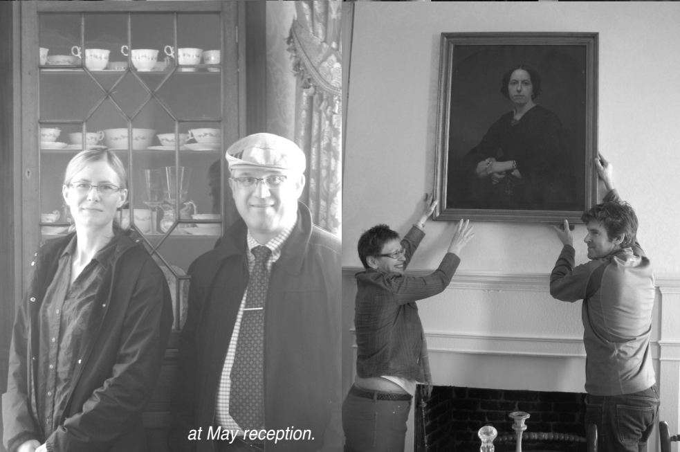
at May reception.